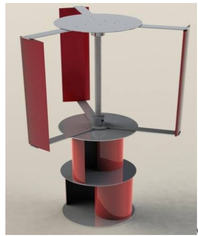
Fig-3: Combined Rotor[5]

COMBINED ROTOR: Combined rotors are the combination of two different rotor (Savonius and H-Darrieus) mounted on the same shaft. Mostly combined wind or water rotors are available in the vertical axis configuration. Combined rotors generally combine Darrieus and Savonius type wind rotors. However, many other configurations might be available for designing of combined rotors. A combined rotor overcomes the shortcomings of the one fold airfoil turbine rotors and takes advantage of another turbine rotor.Since the Darrieus rotor is not self-starting, a blended design with Savonius blade can make the combined which can make it self-starting and more power efficient and high torque co-efficient than any of the single rotor [11].